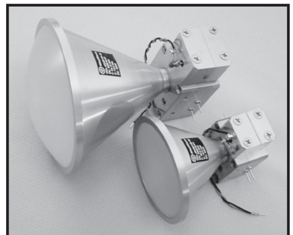
K and Ka Band Doppler Sensor Assemblies

Ducommun is approved to be a company who can not only supply high performance catalog products, but also realize a concept into the hardware with state-of-the-art performance prototypes and cost effective volume production.